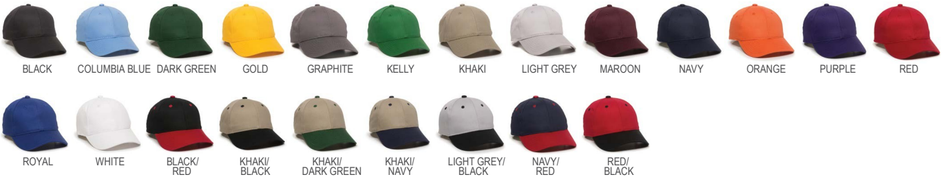
BLACK COLUMBIA BLUE DARK GREEN GOLD GRAPHITE KELLY KHAKI LIGHT GREY MAROON NAVY ORANGE PURPLE RED ROYAL WHITE BLACK/RED KHAKI/BLACK KHAKI/DARK GREEN KHAKI/NAVY LIGHT GREY/BLACK NAVY/RED RED/BLACK