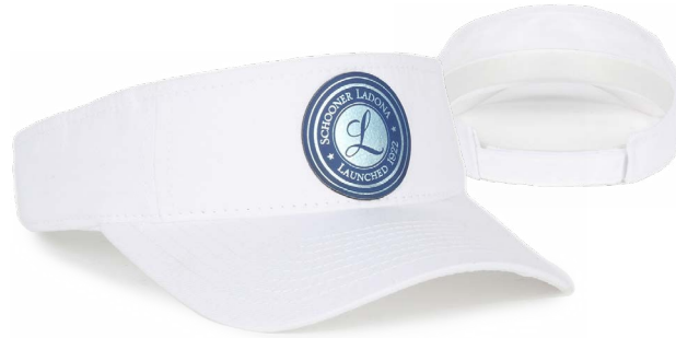
Faux Leather Patch