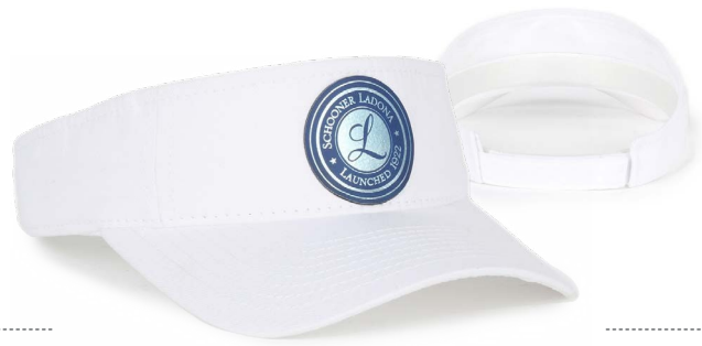
Faux Leather Patch