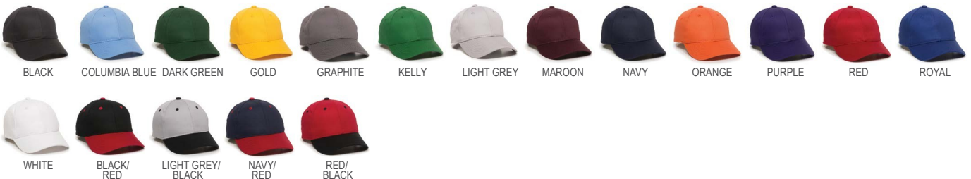
BLACK COLUMBIA BLUE DARK GREEN GOLD GRAPHITE KELLY LIGHT GREY MAROON NAVY ORANGE PURPLE RED ROYAL WHITE BLACK/RED LIGHT GREY/BLACK NAVY/RED RED/BLACK